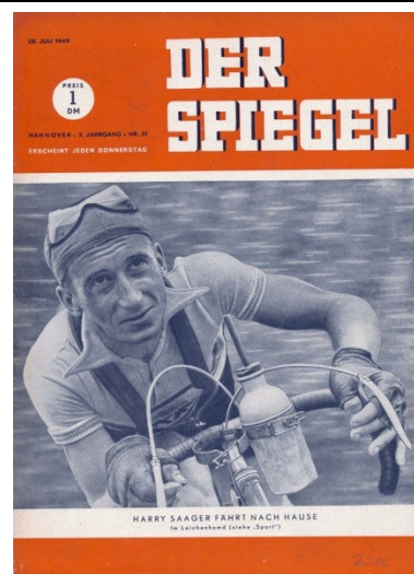
DER SPIEGEL 31/1949