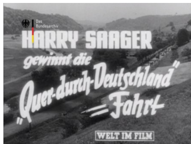
"Helden der Landstrasse" A documentary from 1950

www.filmothek.bundesarchiv.de/video/583650?set_lang=en