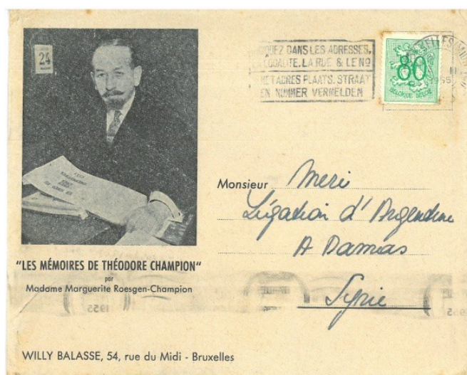
Letter from 1955 with invitation for the presentation of the Memoires of T. Champion