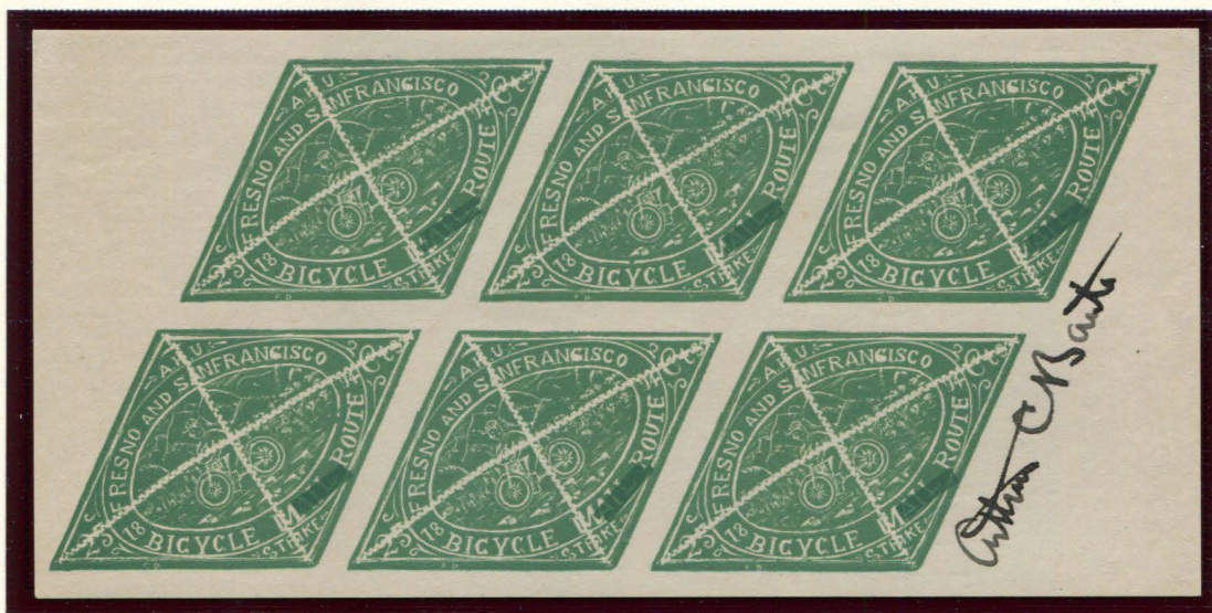
DEFACED REPRINT - SHEET OF SIX GREEN BAR OVERPRINT ON "MAIL" SIGNED "ARTHUR C. BANTA" 25¢ GREEN (12L2)