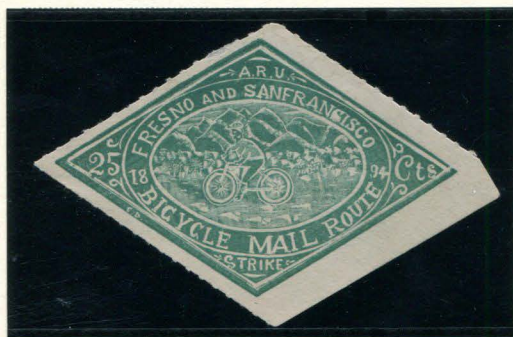
12L2 GENUINE 25¢ GREEN TYPE II

Early copies of the stamp read "San Fransisco". The engraver, Eugene Donze, attributed the mistake to making the die in a hurry. Later stamps corrected this misspelling.