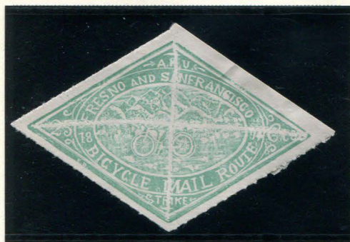
DEFACED REPRINT 25¢ GREEN (SHADE) (12L2)