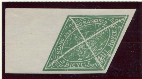
DEFACED REPRINT 25¢ GREEN (12L2)

In 1935, Banta arranged for a re-run of the mail route. For the occasion, he produced additional reprints using the defaced original die. Stamps used on covers for the re-run of the mail route were required to have the word "mail" obscured to fulfill postal regulations. This was done by overprinting a green bar over the word on those stamps.