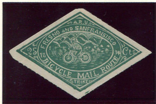
12L1 GENUINE 25¢ GREEN TYPE I