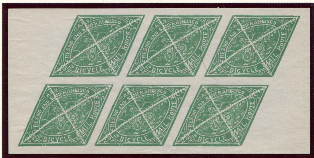
DEFACED REPRINT - SHEET OF SIX 25¢ GREEN (12L2)