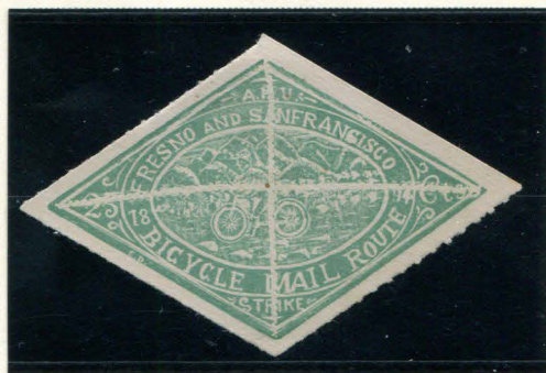
DEFACED REPRINT 25¢ GREEN (SHADE) (12L2)